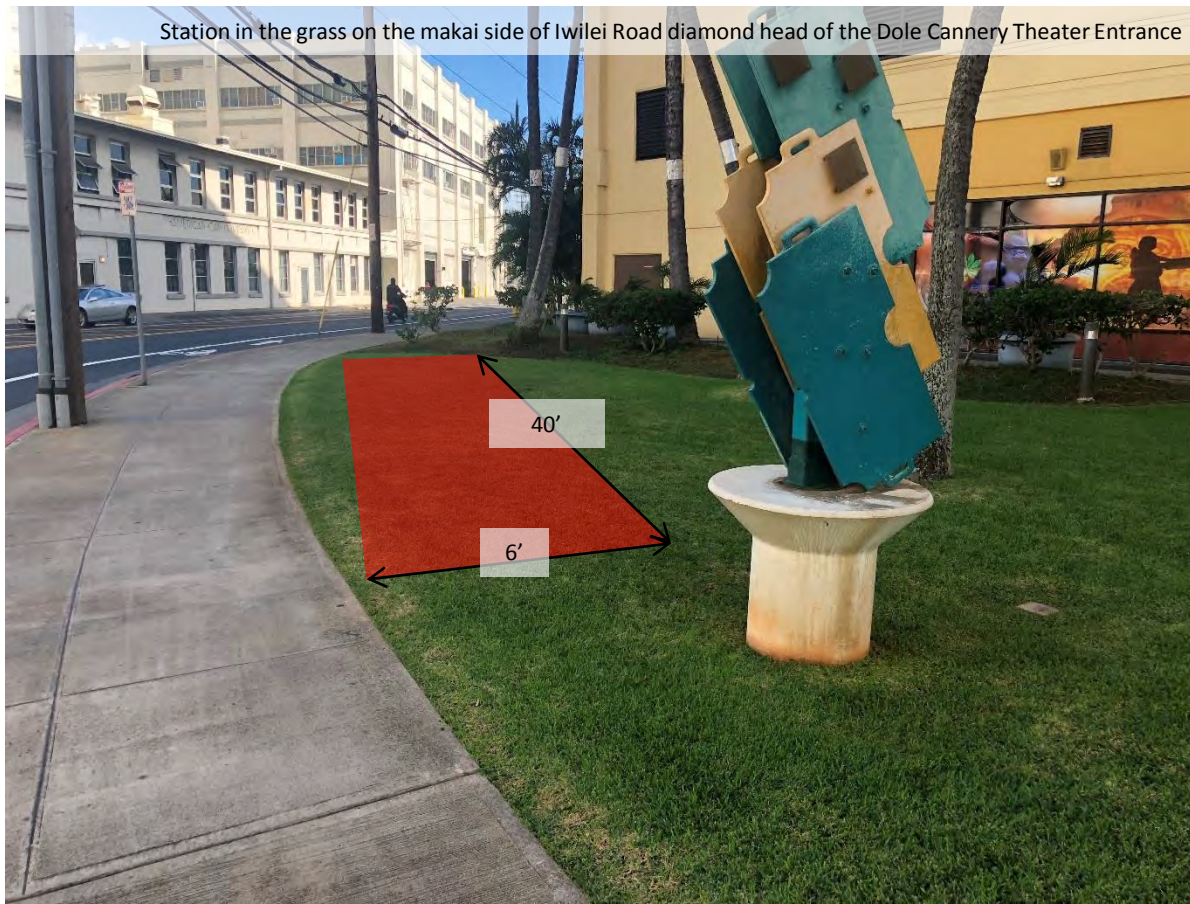
Station in the grass on the makai side of Iwilei Road diamond head of the Dole Cannery Theater Entrance

Location: makai side of Iwilei Road diamond head of the Dole Cannery Theater Entrance